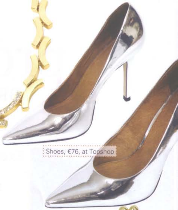
Shoes, €76, at Topshop