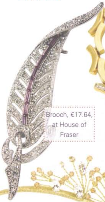
Brooch, €17.64, at House of Fraser