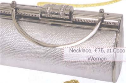
Necklace, €75, at Coco Woman