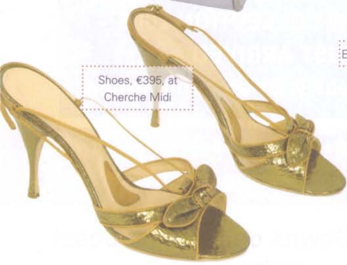
Shoes, €395, at Cherche Midi