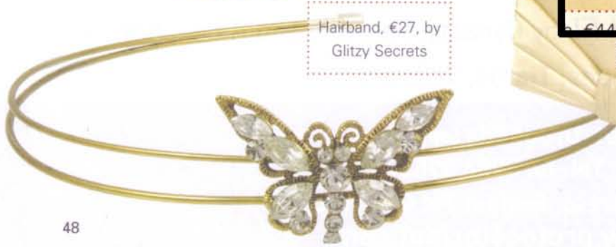
Hairband, €27, by Glitzy Secrets