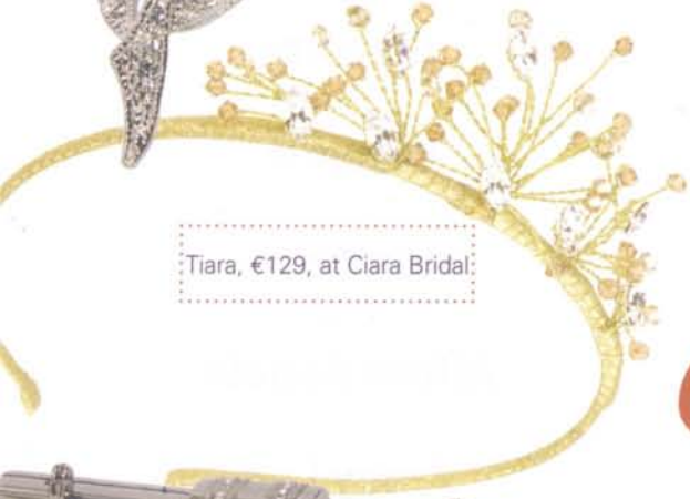
Tiara, €129, at Ciara Bridal