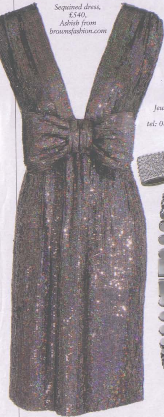
Sequined dress, £540, Ashish from brownsfashion.com