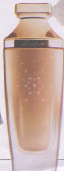
Forever Gold Sublime Radiant Powder for Face & Body, £44, Guerlain, tel: 01932-233887