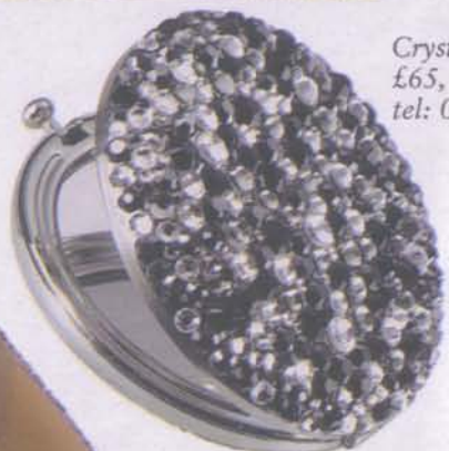
Crystal compact, £65, Jaeger, tel: 0845-051 0063