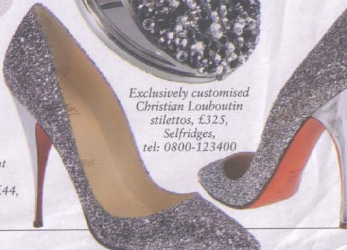
Exclusively customised Christian Louboutin stilettos, £325, Selfridges, tel: 0800-123400