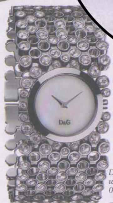
D&G Time Risky watch, £275, tel: 0870-700 0988