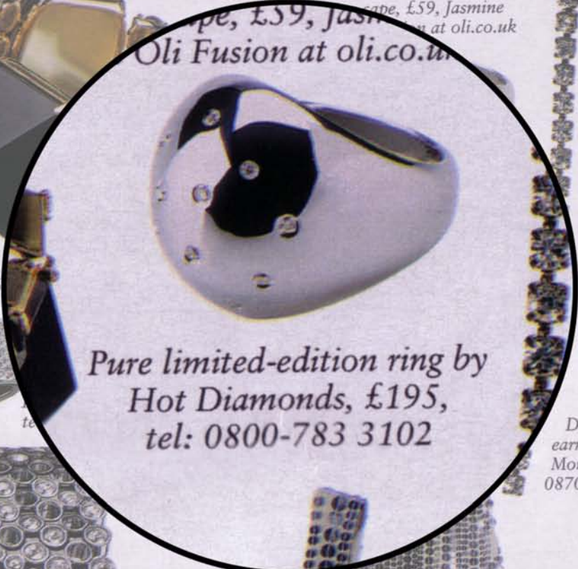
Pure limited-edition ring by Hot Diamonds, £195, tel: 0800-783 3102