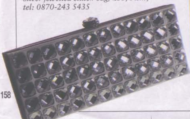
Silver jewelled clutch bag, £35, Next, tel: 0870-243 5435